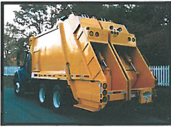
Heavy Duty High Compaction Model RL2-H