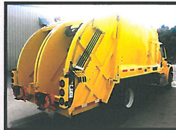
Medium Duty Compaction Model RL2-M