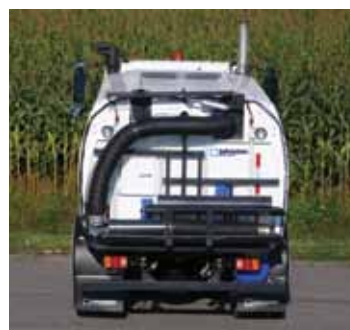
BOTTOM Rear mounted catch basin cleaner