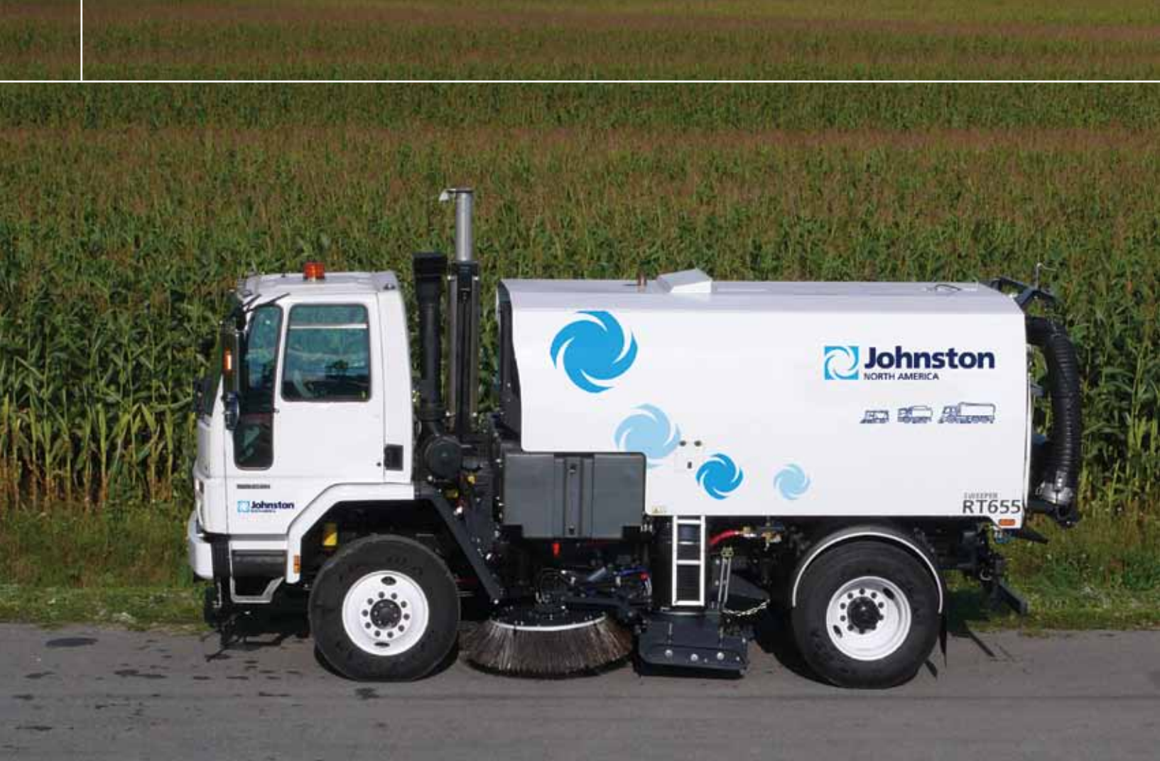
ABOVE The RT655