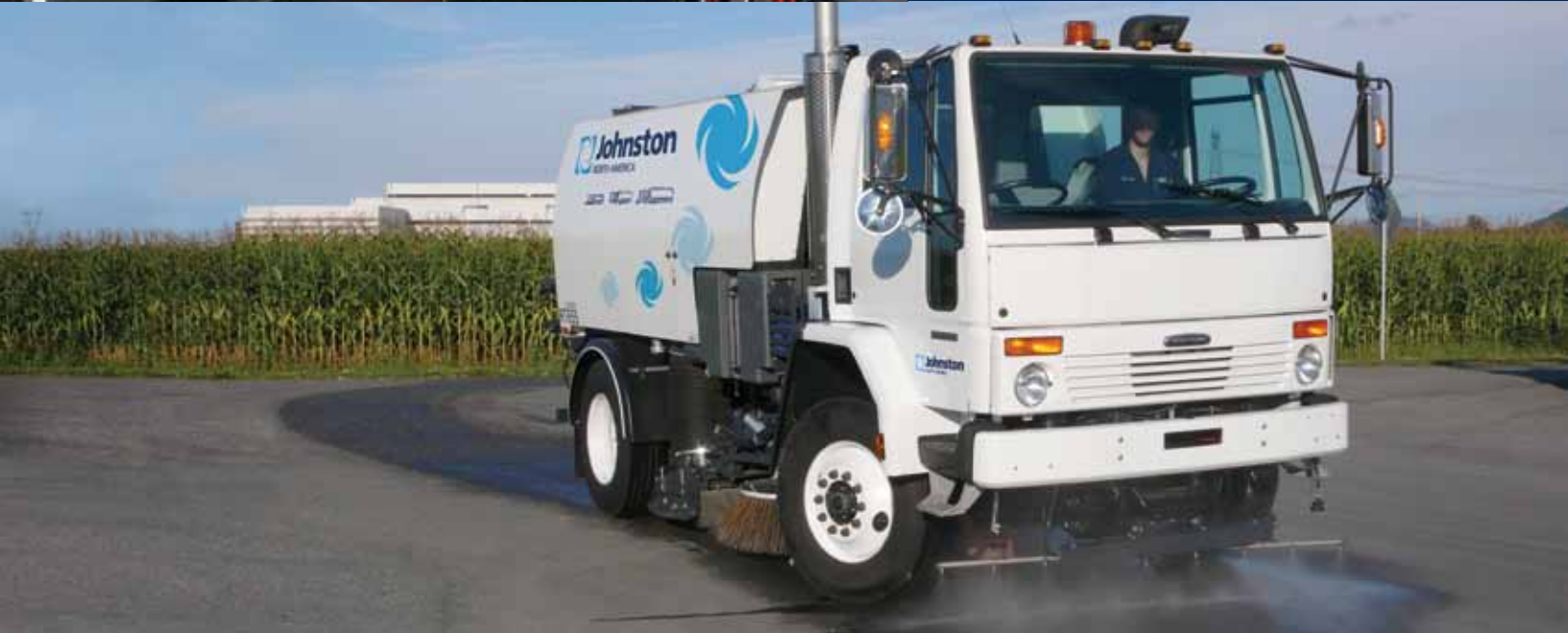
BELOW The RT655