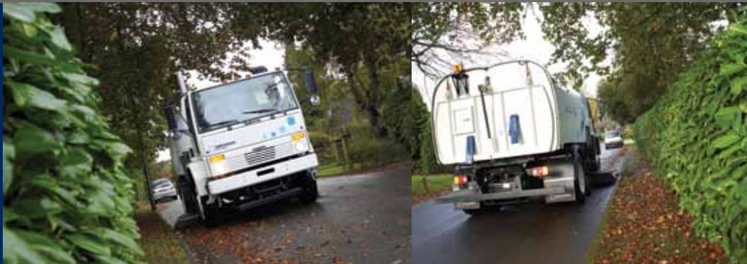
FAR RIGHT 140" swept path