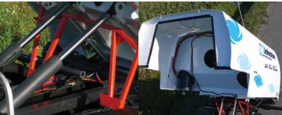
FAR LEFT High visibility body prop

The RT has the option of a stainless steel hopper to further enhance the durability of the sweeper.