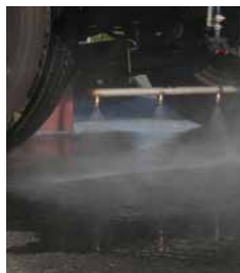
ABOVE The RT655