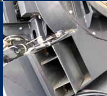
BOTTOM Vacuum exhaust gate