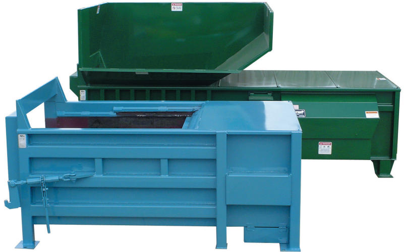
The TC-300T TANK (foreground) compared to a standard 3 cu. yd. compactor showing the difference in overall length — yet the clear-top opening of the TANK is the same as the larger RJ-325. The picture also illustrates that if the TANK is fitted with our standard four-sided, rear feed hopper, there is no need for tread plates or guard rails in many applications.

The large clear-top opening accommodates large bulky items and delivers greater throughput capacity. The TC-300T TANK is ideal for dock feed applications. With our standard four-sided, rear feed hopper, there is no need for special walk-on tops or guard rails in many applications. A 3 yd compactor that can fit into the space of a conventional 2 yd unit.