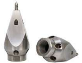
1" Rambo Nozzle