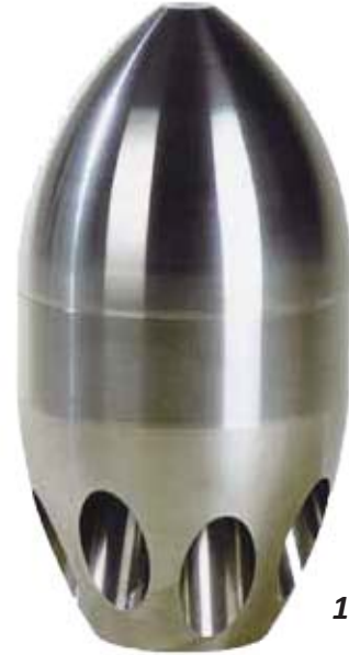
8 Jets at 12° and 18°

The 8 insert set-up can be configured in steel or titanium ceramic. The Torpedo is a Tier Three nozzle, features KEG's highest performing fluid mechanics and is over 95% efficient!